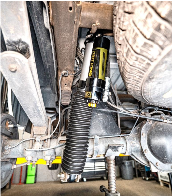
Left side of vehicle